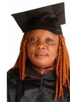
Princess N.Z. Nuah Nimba