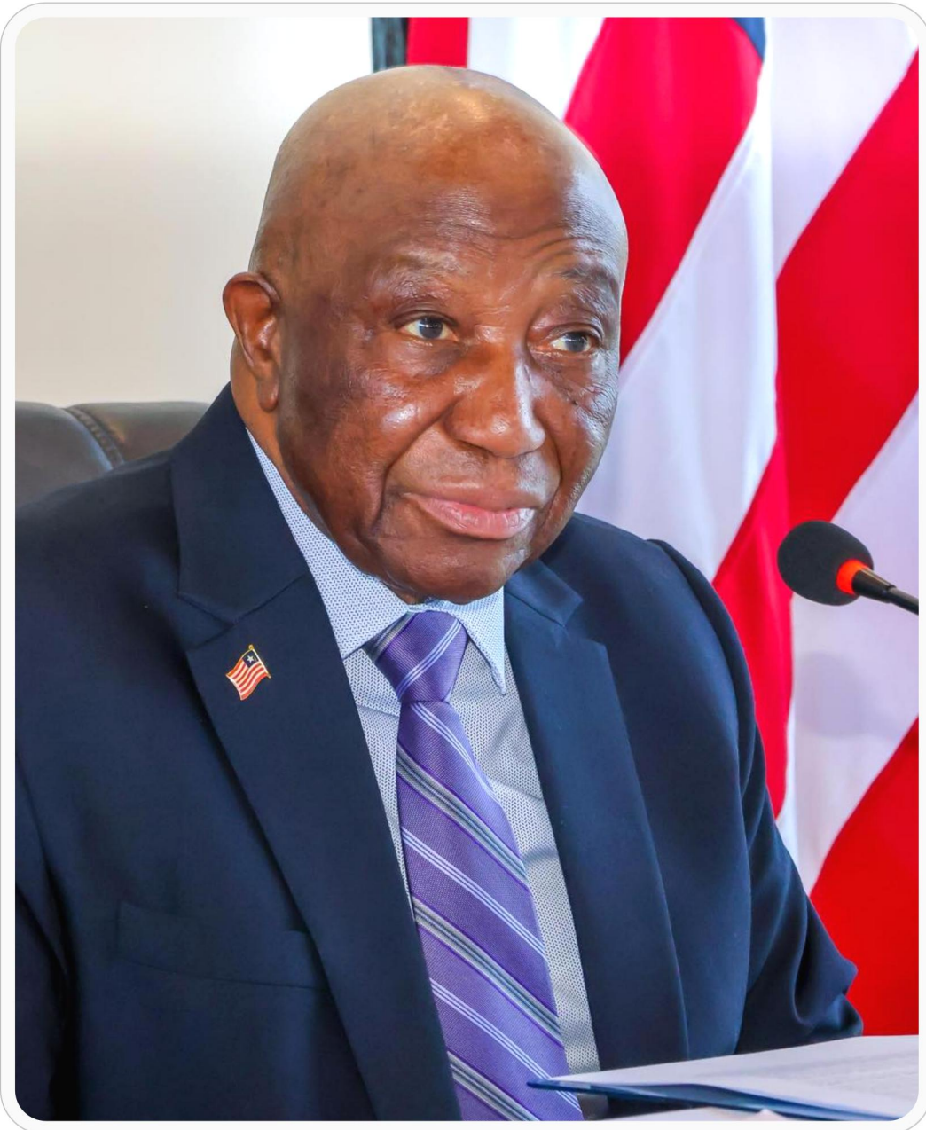
H.E Joseph Nyuma Boakai, Sr. President, Republic of Liberia