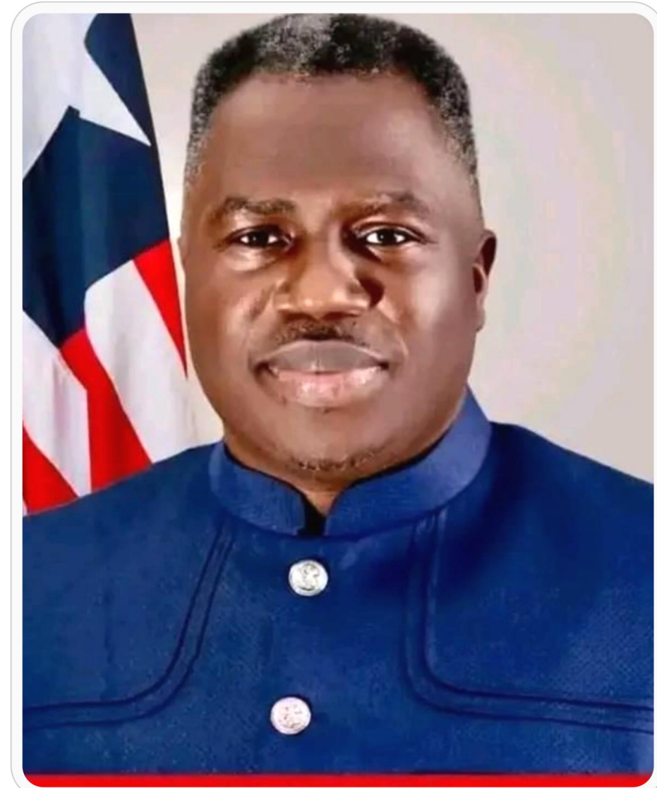
Hon. Jeremiah Kpan Koung Vice-President, Republic of Liberia