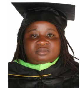
Princess N. Suah Nimba